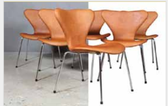
Image Background Removal (also known as image clipping or image cut-out) is a versatile photo editing action. Get rid of distracting backgrounds, ensure your product image stands out, or ensure image uniformity. By analysing your image and its background, our experts choose the most appropriate technique to use. Clipping paths, alpha channels or layer masks are applied as necessary to achieve the best results.